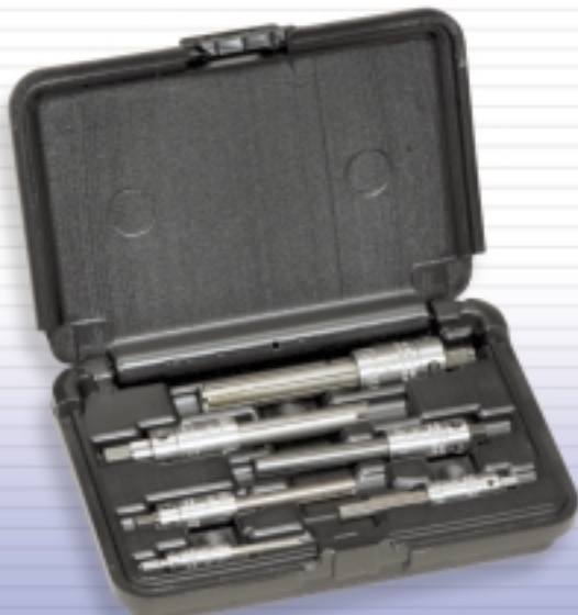
Standard Sets No. 1, 2, 3 packed in 6 compartment plastic case.