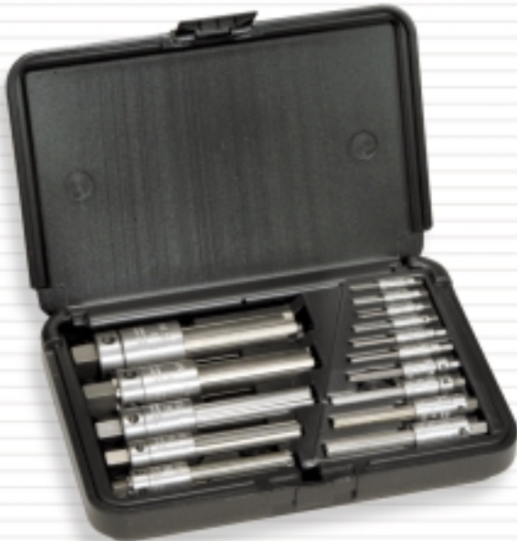
Standard Sets No. 4, 5, 6 packed in 15 compartment plastic case.

Walton™ tap extractor kits are available in six size variations. All parts including holders, collars, and sleeves are packed in a custom made sturdy plastic molded case. All parts come with Walton's lifetime guarantee.