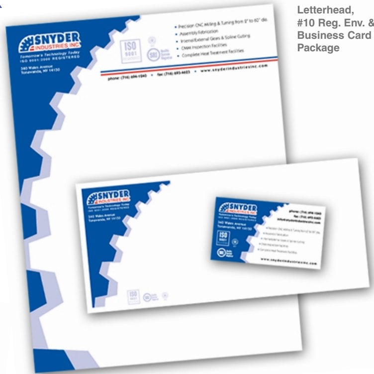
Letterhead, #10 Reg. Env. & Business Card Package

TAC can help your company present a professional image on all your printed materials. From logo design to finished printing of letterhead, business cards, envelopes, forms, or pretty much anything you can imagine. TAC provides a complete printing service offering competitive pricing and personal service on all your company's printing needs. Call us today for a custom quote on your next printing project.